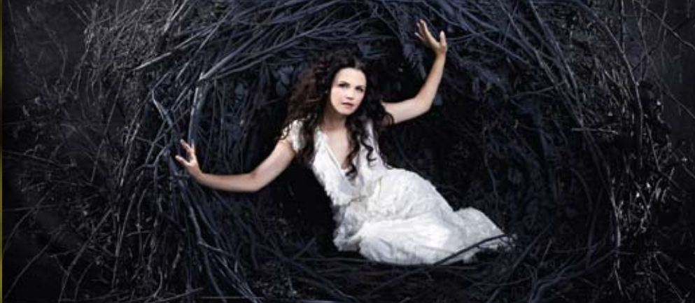
Ginnifer Goodwin stars as Snow White/Mary Margaret in ABC's Once Upon a Time .

At first glance, her life looks enchanting. "When I was little, I thought I was Alice in Wonderland," Goodwin beams, noting that she wore "the dress and everything." She'd often instruct her mother come in her room at varying intervals and say a certain line Goodwin had prepared for her. "She wouldn't belittle it and say, 'Oh, isn't that cute, she thinks she's Alice.'" She would come in and say the line and leave. And I would go on with whatever scene I had created with my dolls."